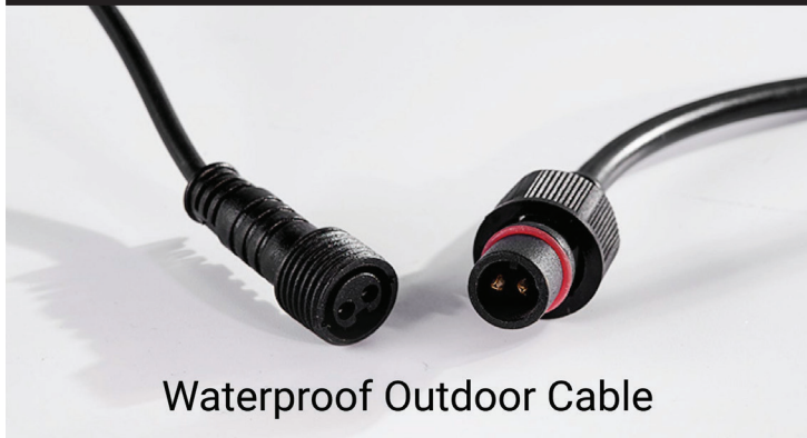
Waterproof Outdoor Cable